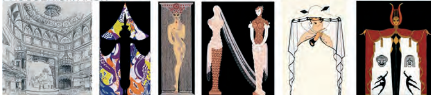
Above and below: some of the interior design concepts considered for 'New York New York'.

Theatre and interior design concepts created by Cirque du Soleil®